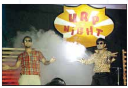
Cultural Programme 2016

Study Tour: The third year students of DURP arrange annual 2-3 day tour in different spots of Sundarbans or Kuakata sea beach. Final year students arrange "Country Tour" where they visit different parts of Bangladesh. Students also visit severalother sites of their academic interest.