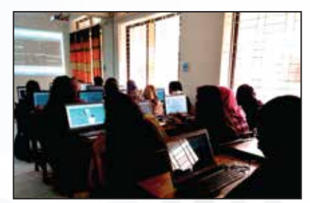
SketchUp Training 2016

Design Integrated Society of KUET (DISK): This club regularly organizes trainings and workshops on Geographical Information System (GIS), Google SketchUp, AutoCAD and related software in spatial analysis and design sector. The aim of this club is to empower students with technical skills to boost up their confidence and problem solving capability both in personal and professional life.