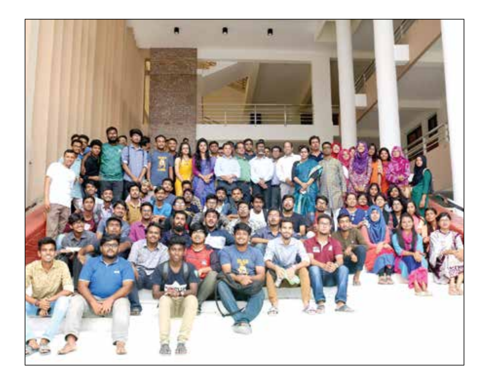
INAUGURATION OF URP BUILDING