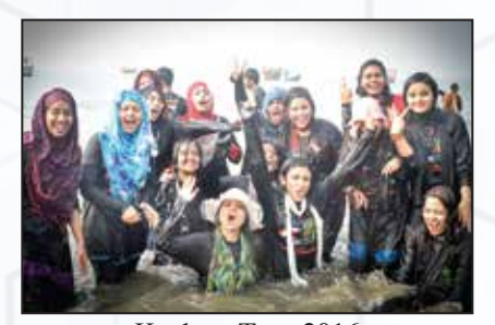
Kuakata Tour 2016