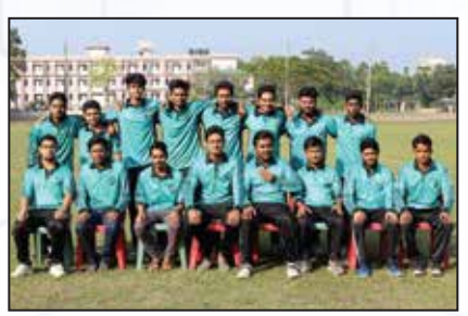
Departmental Cricket Team

Sports: Students also take part in different inter-department tournaments including football, cricket etc.